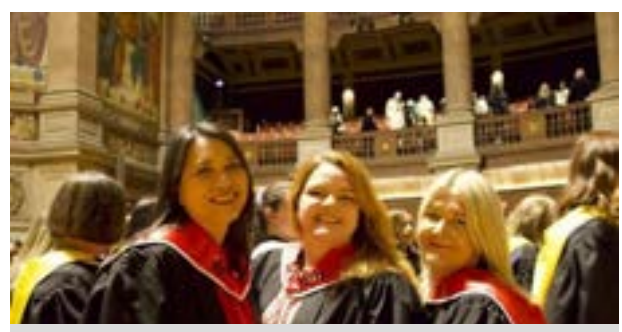
Graduation Day 08 November 2024, some of us had the pleasure of joining in the celebrations.