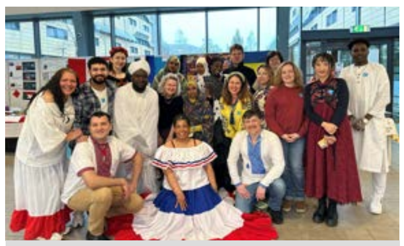
ESOL Students celebrated International Day on 10 December 2024 and raised over £600 for UNICEF. Well done to all involved.