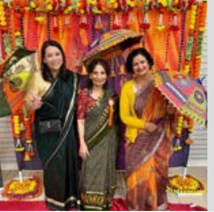
Diwali party organised by Edinburgh Hindu Mandir & Cultural Centre at Granton Campus.